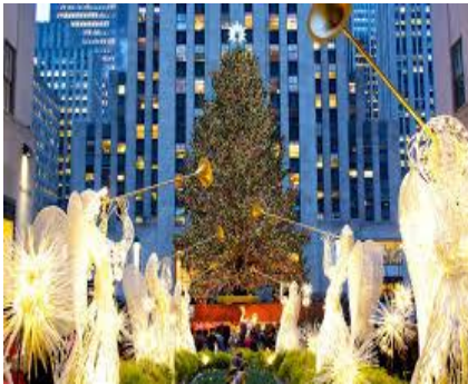
Tree at Rockefeller Center is a 25 min., walk from the Hotel.